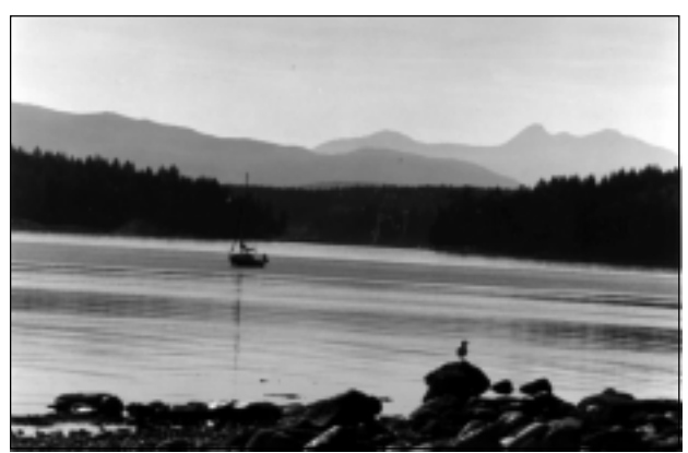
According to experts, the United States has done little to conserve the great natural resources of our oceans. Environmental groups have pressed for ocean "no-take" zones where wildlife can live in tranquillity, free from the threats of big industry and human activity.

Ut of sight, out of mind" is the phrase most applicable when examining the health of oceans along the U.S. coasts. While parts of the U.S. landmass have benefited from designation as federally protected areas, little such status has been granted to the seas. Not until May 2000 did U.S. President Bill Clinton issue an executive order to expand the protection of U.S coastal "marine protected areas" where fishing, offshore drilling, and other "consumptive uses" of marine resources would come under closer scrutiny.<sup>2</sup> Signed into law in August 2000, the order establishes a 16-member commission to study ocean issues and recommend long-term strategies. Though heralded by conservation organizations as a progressive step, the law appears unlikely to produce any quick, tangible results. In late 1999, Tundi Agardy, a marine expert at Conservation International wrote: "The United States has done virtually nothing to conserve this great natural resource or to actively stem the decline of the oceans' health."<sup>3</sup> Although the United States has the highest marine ecosystem diversity of any nation in the world, it has no comprehensive system